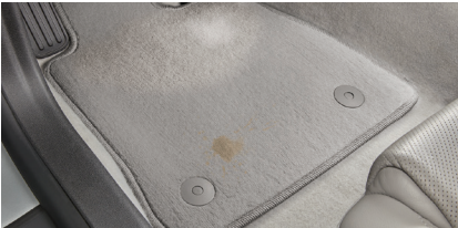
Removable stains and minor carpet wear