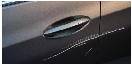
1 dent (more than 4") or 1 scratch (equal to or more than 6") per panel