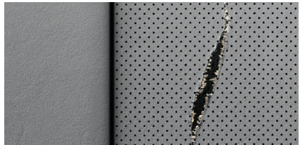
Tears more than 1/2"