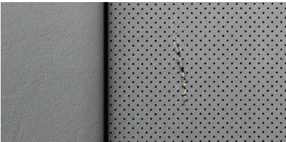
Tears equal to or less than 1/2"