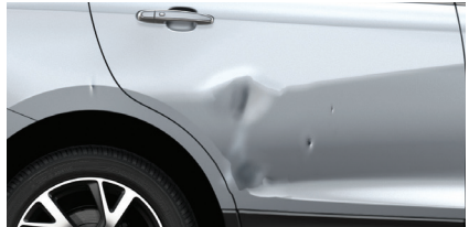
4 or more dings per panel