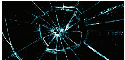
Cracked glass (equal to or more than 1/2" in diameter) or spidered cracks