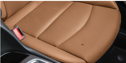
Upholstery holes equal to or less than 1/8"