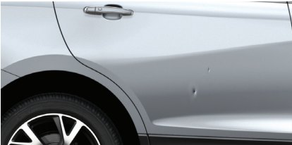
Fewer than 4 dings (less than 2") per panel