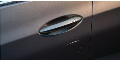
1 dent (equal to or less than 4") or 1 scratch (less than 6") per panel